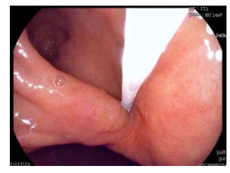
Fourth injection of adenovirus