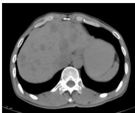
First injection of adenovirus