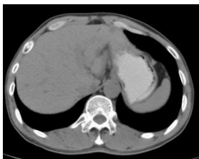
Third injection of adenovirus