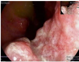
First injection of adenovirus