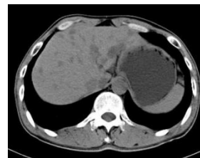
Second injection of adenovirus