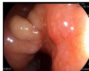
Third injection of adenovirus