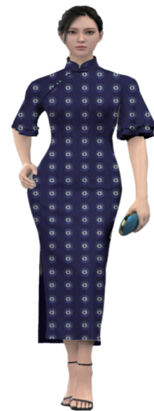
Fig. 2 Blue clamp-resist dyeing cheongsam virtual 3D display

2021 General Scientific Research Project of Education Department of Zhejiang Province (Project No. Y202148089)