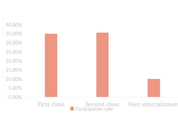
Fig2. Survey data