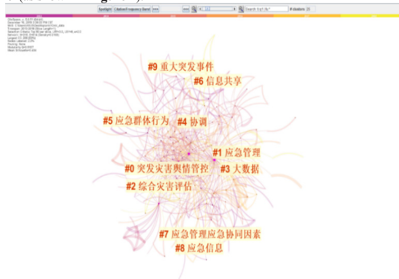
Figure 1. Top 10 keywords of emergency management research in 2013-2019.

(1) Through the keyword frequency statistics, the top 10% keywords are taken as the research direction of emergency management during 2013–2019 (as shown in Figure 1 ).