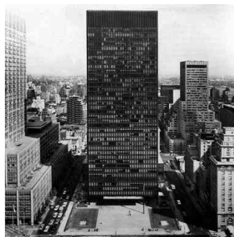
Figure 3. Seagram Building by Mies van der Rohe

The high-rise glass and steel framed structure as well as the “less is more” approach by Ludwig Mies van der Rohe can be selected as the most prominent representative for the sober and rational modernism. The “less is more” in design maximumly reflect his architecture and artistic characteristics and even inspire and enlighten the world afterwards. The pure and meaningless structures seemingly convey his abandonment on personal desires but has become standard for popular architecture. During his whole life for creation and as the father for steel and glass structure, he remains committed to being guided by his philosophies rather than being driven by users’ domestic and external demand or environments in architecture. In this sense, his theory serves as horn for dictatorship, instructing users to work as machines. Seagram Building as shown in Figure 3 is one of his masterpieces. The square like glass box restricts people’s life in the pre-determined scene. The giant delivers certain sense of authority and oppression. Future urban cities and building landscapes sustained by technologies are more utopian in the view of the radical futurists.