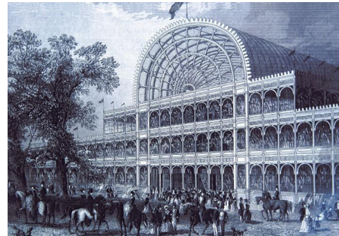
Figure 2. Crystal Palace established in 1851.