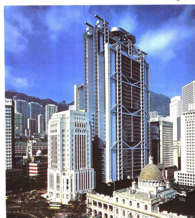
Figure 6. HSBC building by Foster & Partners.