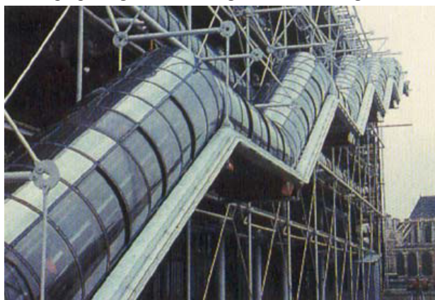
Figure 5. Centre pompidou by renzo piano.

Rapid development is accompanied by opportunities and threats. On one hand, megastructure gives prominence to integrity and mobility of design. It enables efficient production and social functioning to integrate resources in a more ingenious way. Centre Pompidou as shown in Figure 5 stood as the most typical representative at that time. “The bright colors, ingenious style, inflatable products, adjustable accessories, huge projection screen empower it become an outstanding and attractive architecture at the second machine age together with cheerful old images new drawings and spliced photos [6] . Once being highly praised by Banham; On the other hand, the design completely from top to down, oppression by huge volume and absolute control by homogenized design have revealed authority of capitalism to some extent. The HSBC building as in Fig.6 accomplished by Foster & Partners aims to sweep up congestion on the ground and boring blocks and streets but build intricate and diversified space vertically.