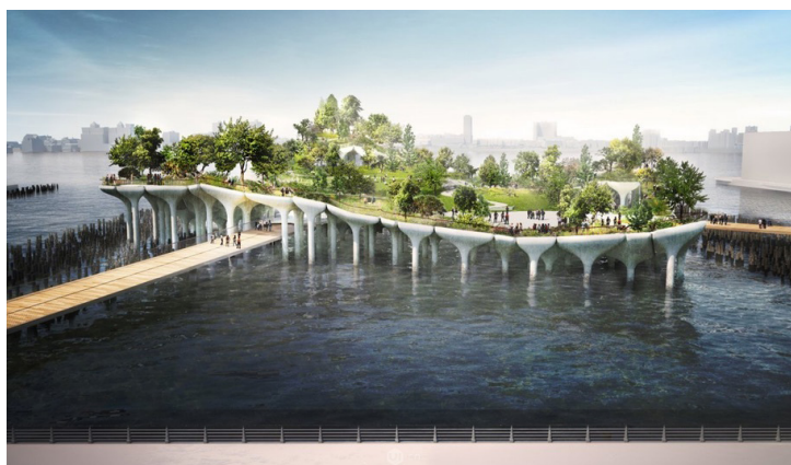
Figure 7. Image and Sound Museum in Rio de Janeiro.

While those megastructure landscapes led by large economic and political groups have gradually evolved into comprehensive and efficient machines of monopoly and authority. In these circumstances, people's majority paths have been preset by designers, which has turned into autocracy in nature.