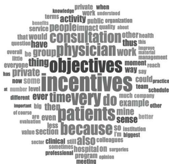
Figure 3. Word cloud.

The other case, with a base salary, presents itself as a medical service provider “through green receipts”. All these cases present a 100% dedication to the private sector. In the keyword analysis, the most relevant words for the theme with a relative weight greater than 0.5% were “incentives”—0.81%, “goals”—0.63%, “users”—0.62%, and “doctor”—0.53%. The word cloud is represented in Figure 3 . Word frequency queries allow us to summarize and visualize the words or concepts extracted from the interviews, to identify emerging themes and words used by the participants, thus performing an initial exploration of the study’s textual information. In terms of content, the relevance of incentives for retention of medical professionals and how they reflect on organizational goals and patient care is observed [33,40] .