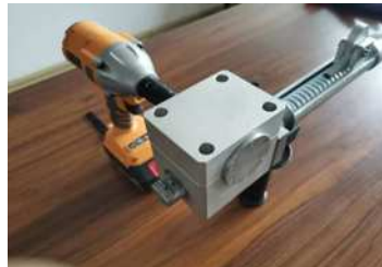
Fig .3 Assembly Form of Fast Lock Anchorage Tool

The rack jacket can protect the drive rack from wear, prolong the service life, and increase the force area. The rack coat is connected to the housing, which is equipped with a housing cover. The inner hexagonal screw is often used in machinery. It is mainly easy to fasten, disassemble, not easy to slide, etc. The inner hexagonal wrench used in fastening or disassembling is generally a 90 bend. One end of the bend is long and one side is short. The effect after assembly is shown in figure 3.