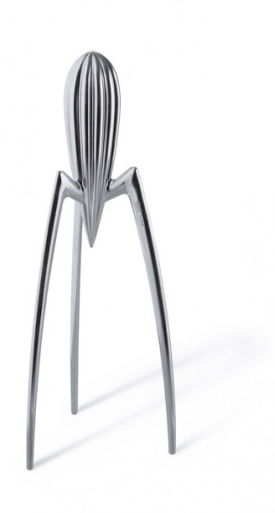
Figure 1: 'Juicy Salif' lemon squeezer by Philippe Starck for Alessi

'Juicy Salif' lemon squeezer is one of the well-known postmodern design products from all over the world, which designed by the famous French designer Philippe Starck. The product was first manufactured by Centro Studio Alessi S.p.A. in 1990 (Fig 1). The unprecedented design of the lemon squeezer makes it become one of the Alessi company's long-term popular products. A minimalist design style, three-legged form, which looks like a squid or a spaceship. The source of design inspirations has a variety of versions, undertaking this product in a range of mysteries. On the one hand, as Lloyd and Snelders (2003) state that Philippe Starck himself described that when he walked into a pizzeria restaurant and noticed a lemon-like squid, realized the design inspiration of the lemon squeezer and immediately started sketching in the dining placemat (Fig 2). On the other hand, the inspiration for this design brainwave could not be separated from the influence of his father's career (his father worked for aeroplanes) and had a deep affinity with science fiction comics from his childhood (Fig 3).