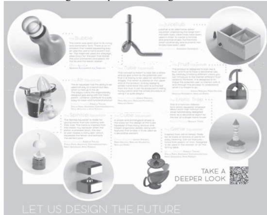
Figure 5: Tried to improve the practicality of the program