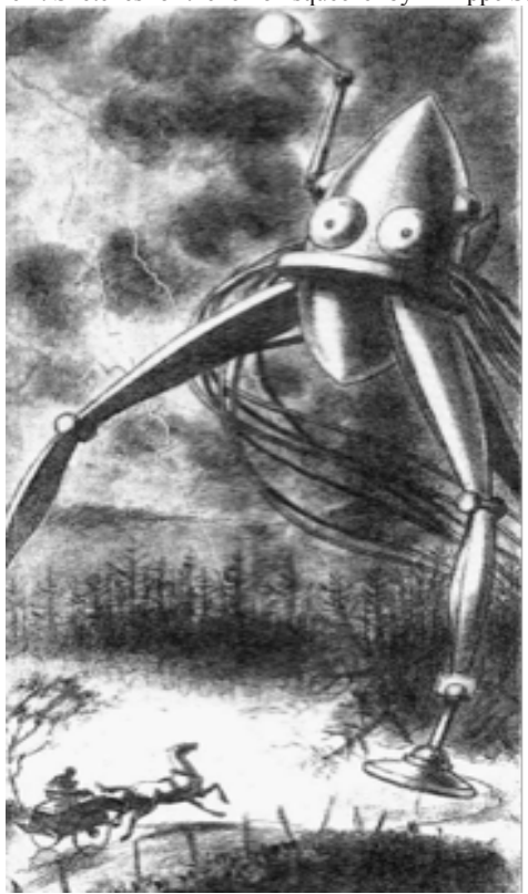
Figure 3: 'The world under attack '- science fiction that Starck read as a child