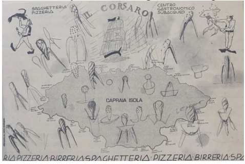
Figure 2: Sketches for the lemon squeezer by Philippe Starck

of practicality has no significant effect on the contributions to the consumer society and postmodern design in terms of aesthetics, innovation and economy. The lemon squeezer has achieved massive success. The approach to analyze using four different aspects to assess the contributions of 'Juicy Salif' lemon squeezer: practicality, aesthetics, innovation, and economy. Therefore, this report will argue that although lemon squeezer has insufficient functions, there are significant pieces of evidence to demonstrate that it has made a great contribution to aesthetic, innovation and economy, which has a profound impact on the postmodern design.